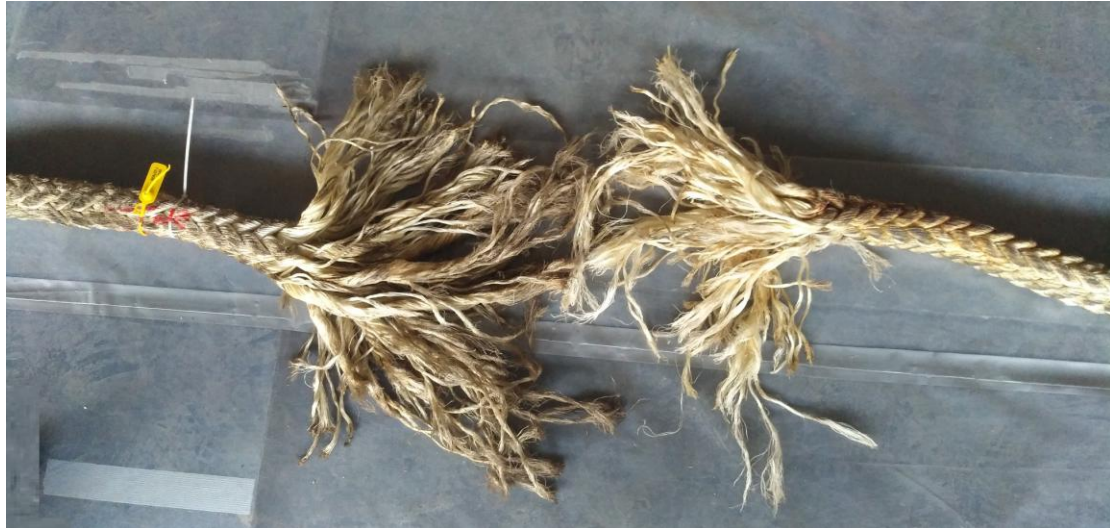
Figure no 1: Both parts of the mooring line after its breakage.

At the following page (Figure no 2) the Non-authentic document issued for the parted mooring line is displayed.